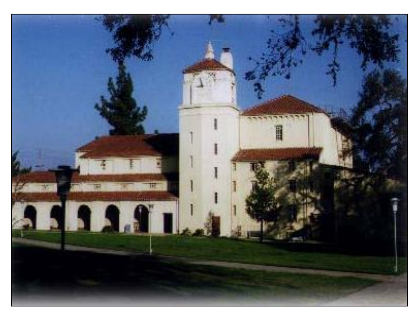
Cal State University San Bernardino